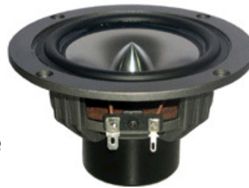
4" TI FULL RANGE